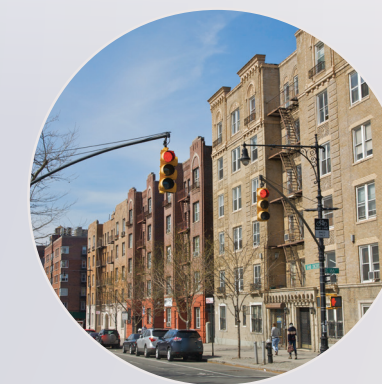
Residents learn how to partner with community organizations in the Bronx.

Residents who work with underserved populations must get to know their