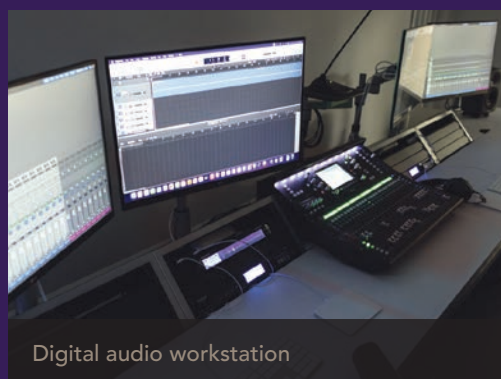
Digital audio workstation